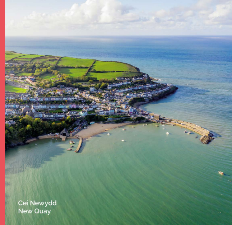
Cei Newydd New Quay